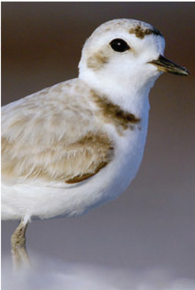
Snowy Plover, Alex Cropp

In exploring which values were most compelling, the committee members considered some possible ways that future park-related actions could embody their values — these are offered as preliminary guiding principles that could be further explored as part of gathering additional public input. The ranked list in Table 1 indicates the principles that most resonated with the CAC members.