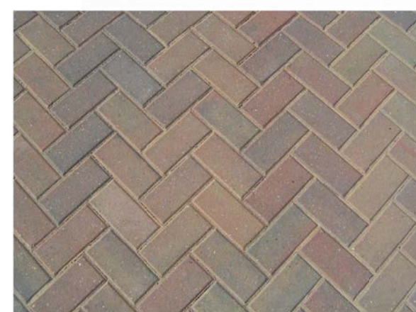
BRICK DRIVEWAY PAVERS