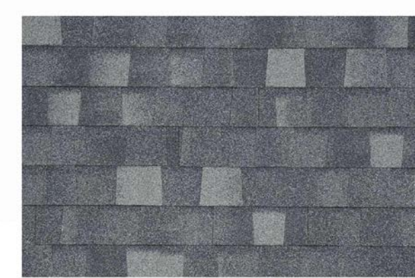
CERTAINEED COMPOSITE SHINGLES, GRANITE GRAY CLASS-B MIN