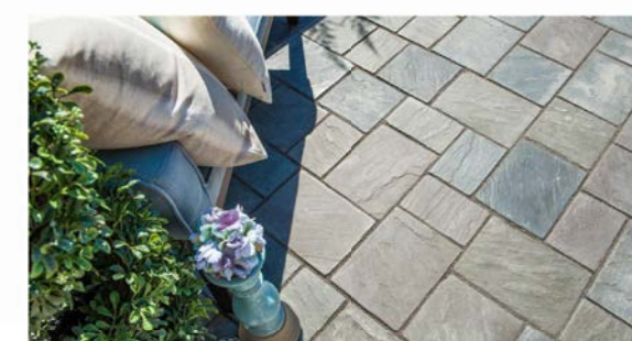
FLAGSTONE PATIO PAVERS