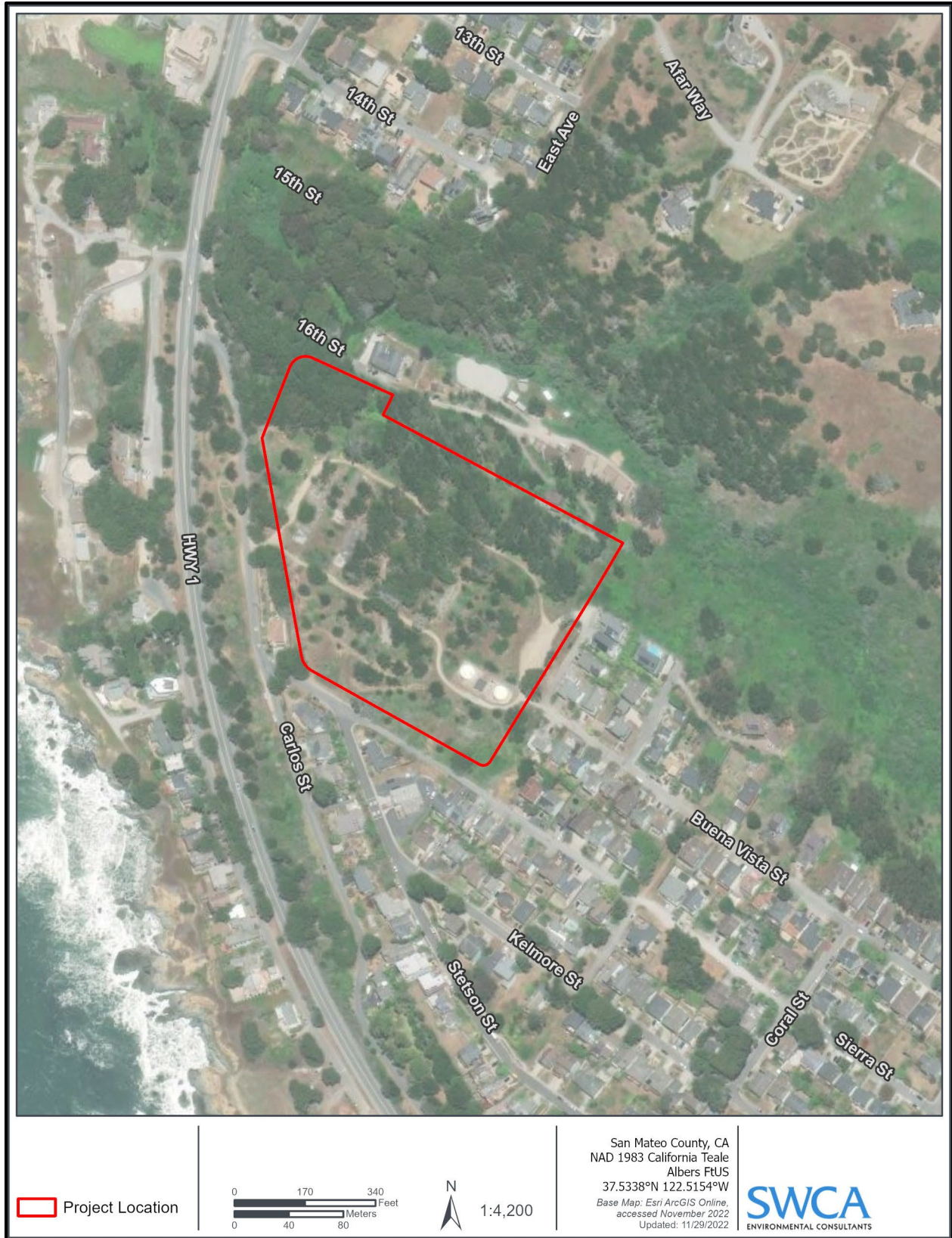
Figure 2. Project Location