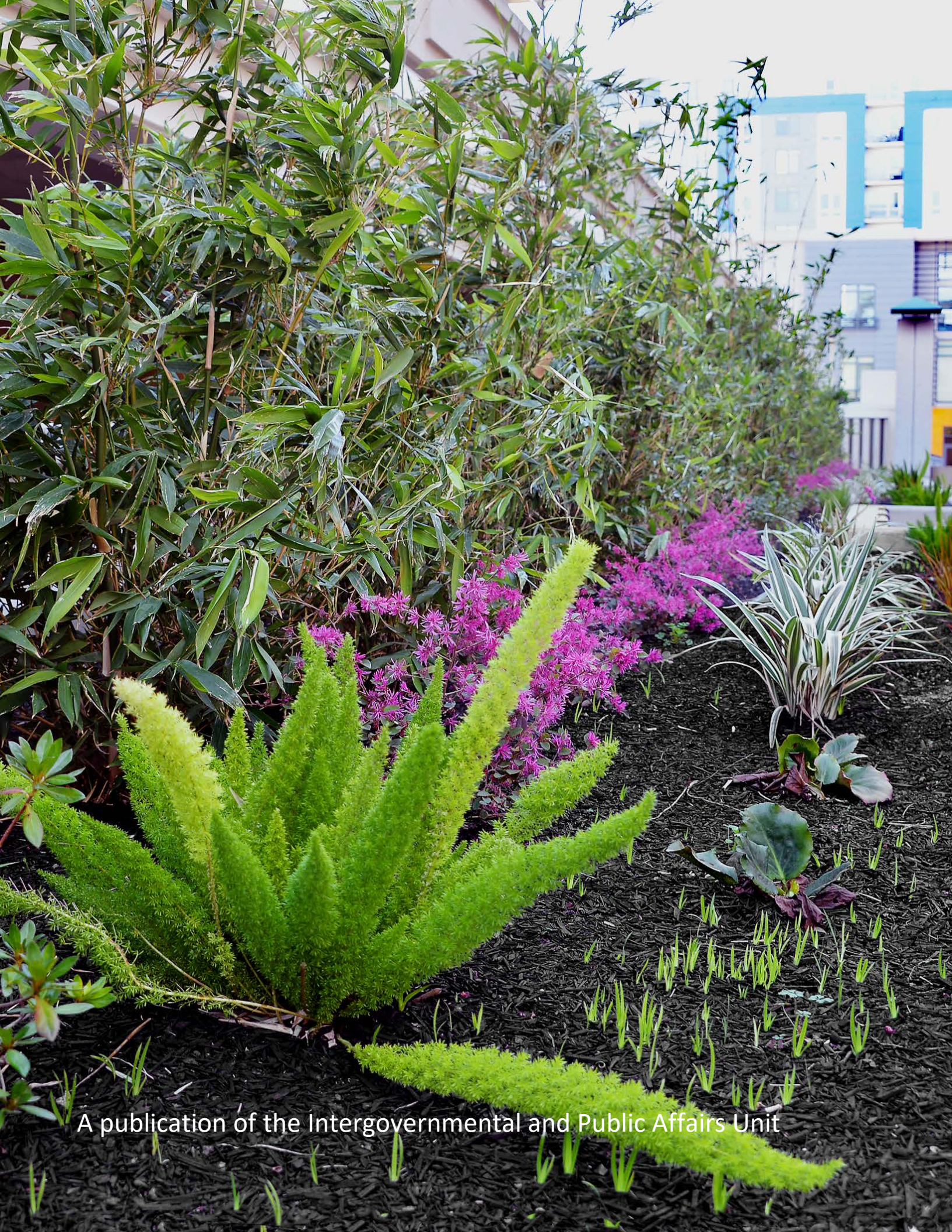
A publication of the Intergovernmental and Public Affairs Unit